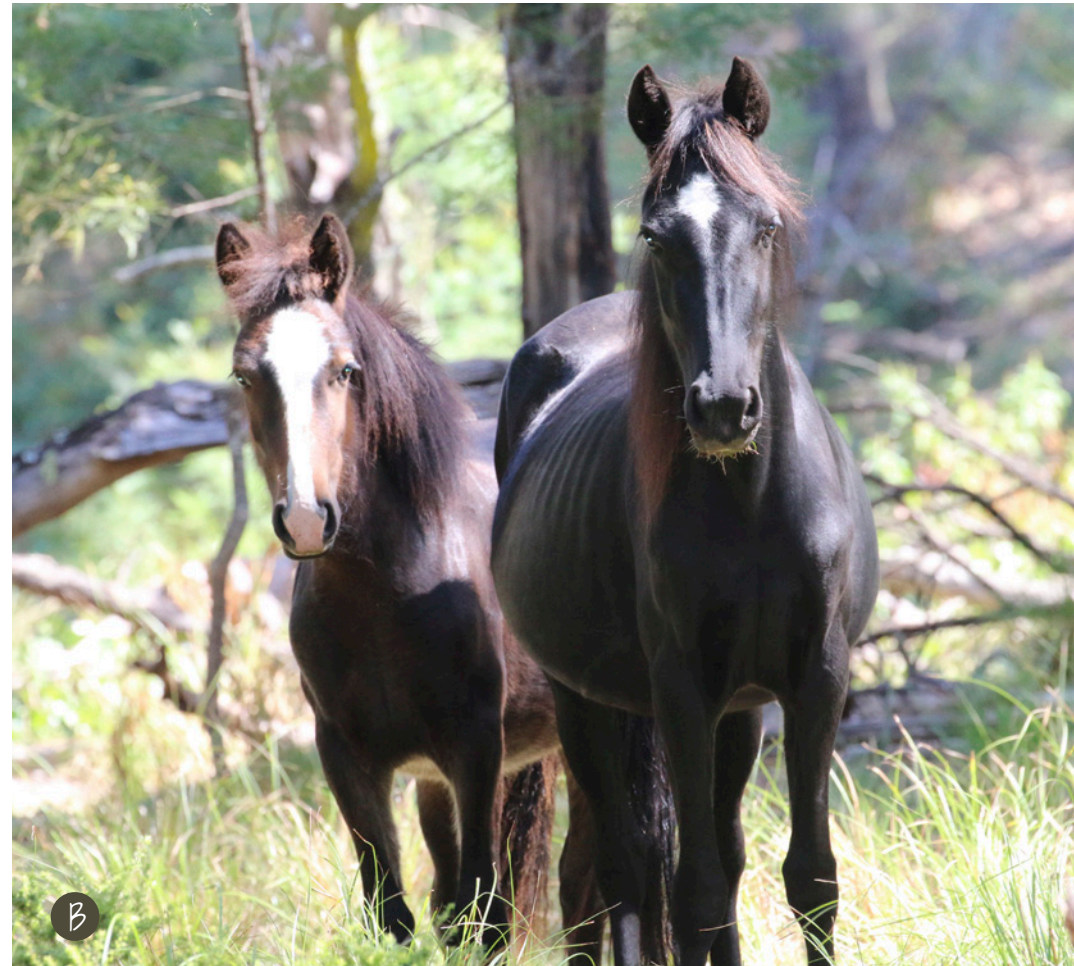
IMAGE A: My first three brumbies. Although we had other horses already, given that brumbies have strong social bonds and are used to being in herds with other horses of similar ages, in order to optimise their welfare and social experiences, I ended up coming home with three yearling brumbies.